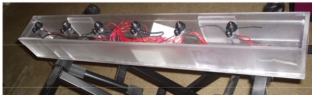
Figure 1. The MLGI interface

We have also experimented with the use of ultrasonic sensors to use in correlation with the photocells, in order to obtain more accurate data for evaluating and processing continuous control messages. Though ultrasonic sensors are more expensive, we recognize the need for accuracy in our data and are currently looking into various ways of implementing them in our design. Details on the design of the MLGI controller are available online 1 .